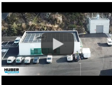
Video: Complete wastewater treatment at the Øygarden WWTP in Norway

https://www.youtube.com/watch?v=BKPMhiNjmRI