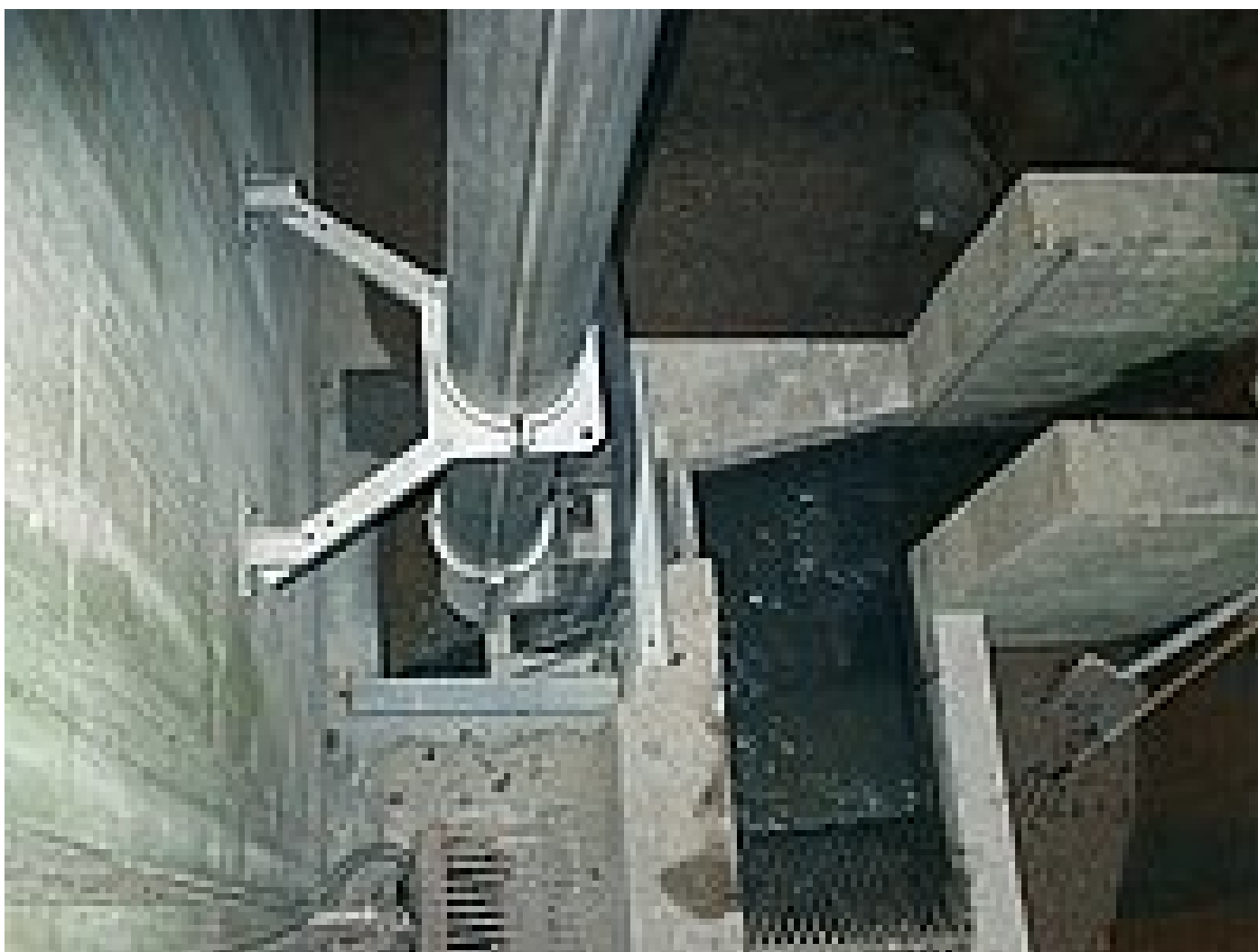
Lower section of the RoK 4 with screen basket and IRGA for screenings washing