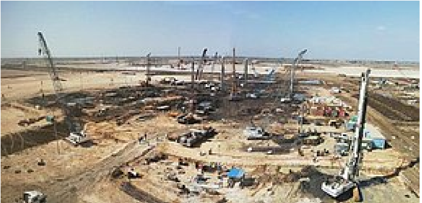
Impressive in size – the huge construction site in Egypt

A sewage treatment plant is under construction in Egypt, in the east of the Suez Canal, for the treatment of wastewater and agricultural wastewater from the sewer system Bahr El-Baqar.