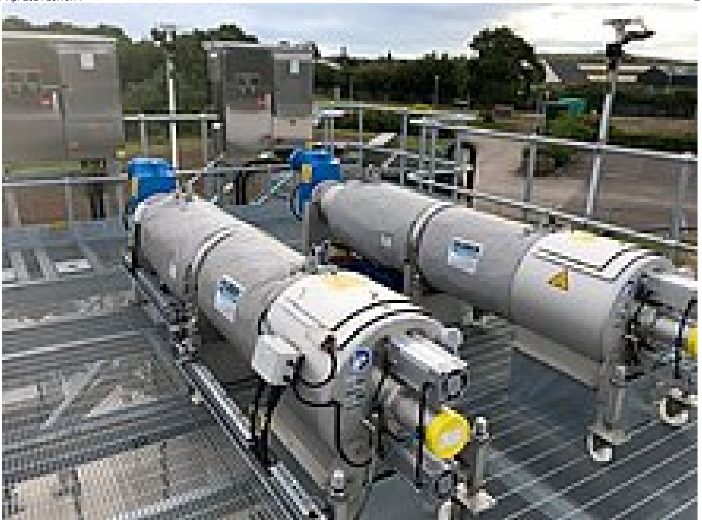
Cannock STW installation with HUBER Sludgecleaner STRAINPRESS®