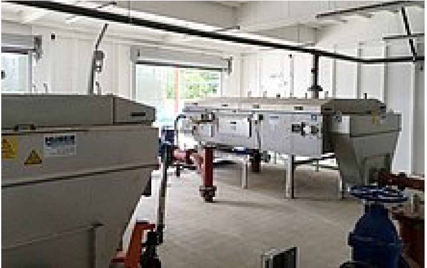
Cannock STW installation with the HUBER Belt Thickener DrainBelt