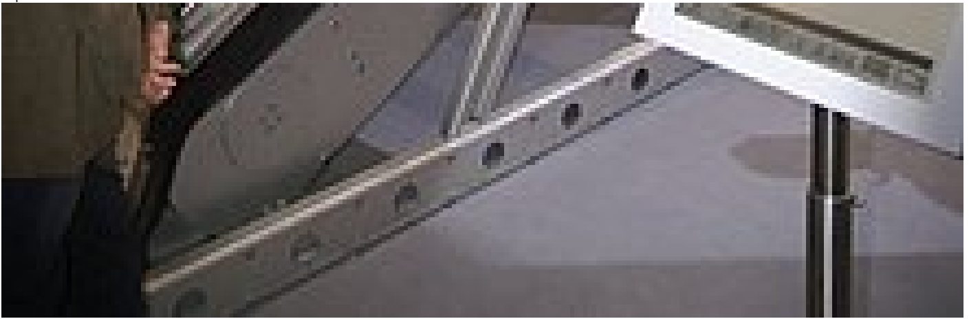
The prototype of the L-shaped RakeMax®-hf screen was for the first shown at IFAT 2010.