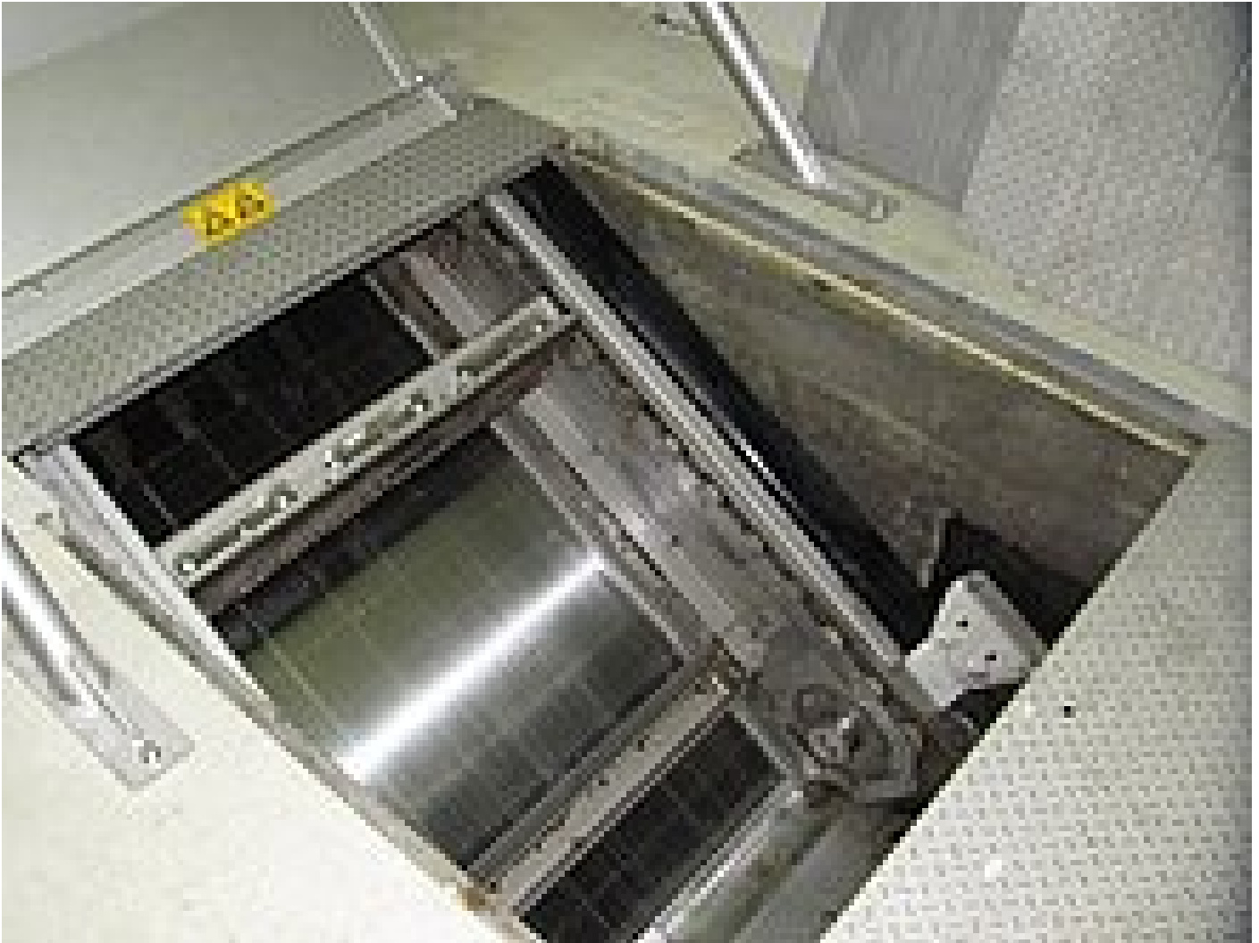
Due to the extremely flat installation of the bar rack the screen section through which the flow passes is always double the water level in the channel.