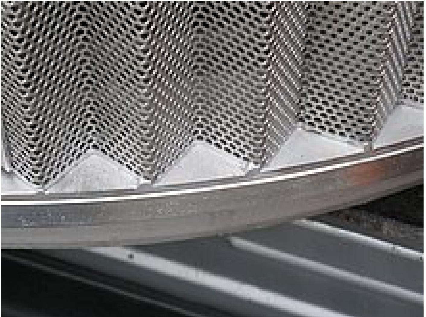
Star-shaped screen drum of the ROTAMAT® Perforated Plate Screen RPPS-Star

On the basis of the worldwide known and well-proven system of HUBER ROTAMAT® fine screens with wedge wire screen basket we developed the ultra-fine ROTAMAT® Perforated Plate Screen RPPS with perforated plate. The two-dimensional screen (perforated plate) ensures the reliable removal of hairs and fibres and avoids that: