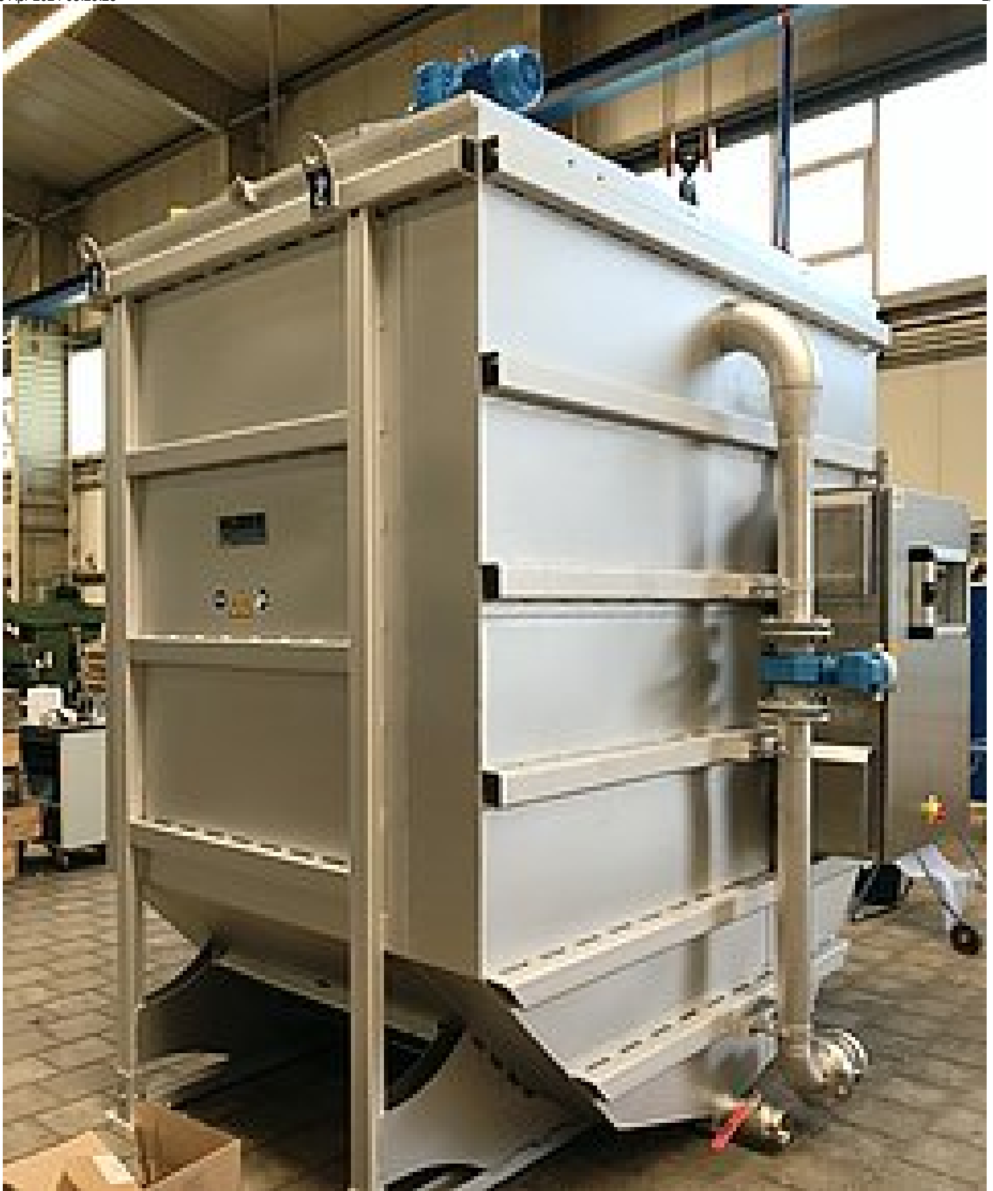
Ready for IFAT: The "big brother" of this HUBER Pile Cloth Media Filter RotaFilt® mobile demonstration plant will be exhibited at the world's leading trade fair of the industry.