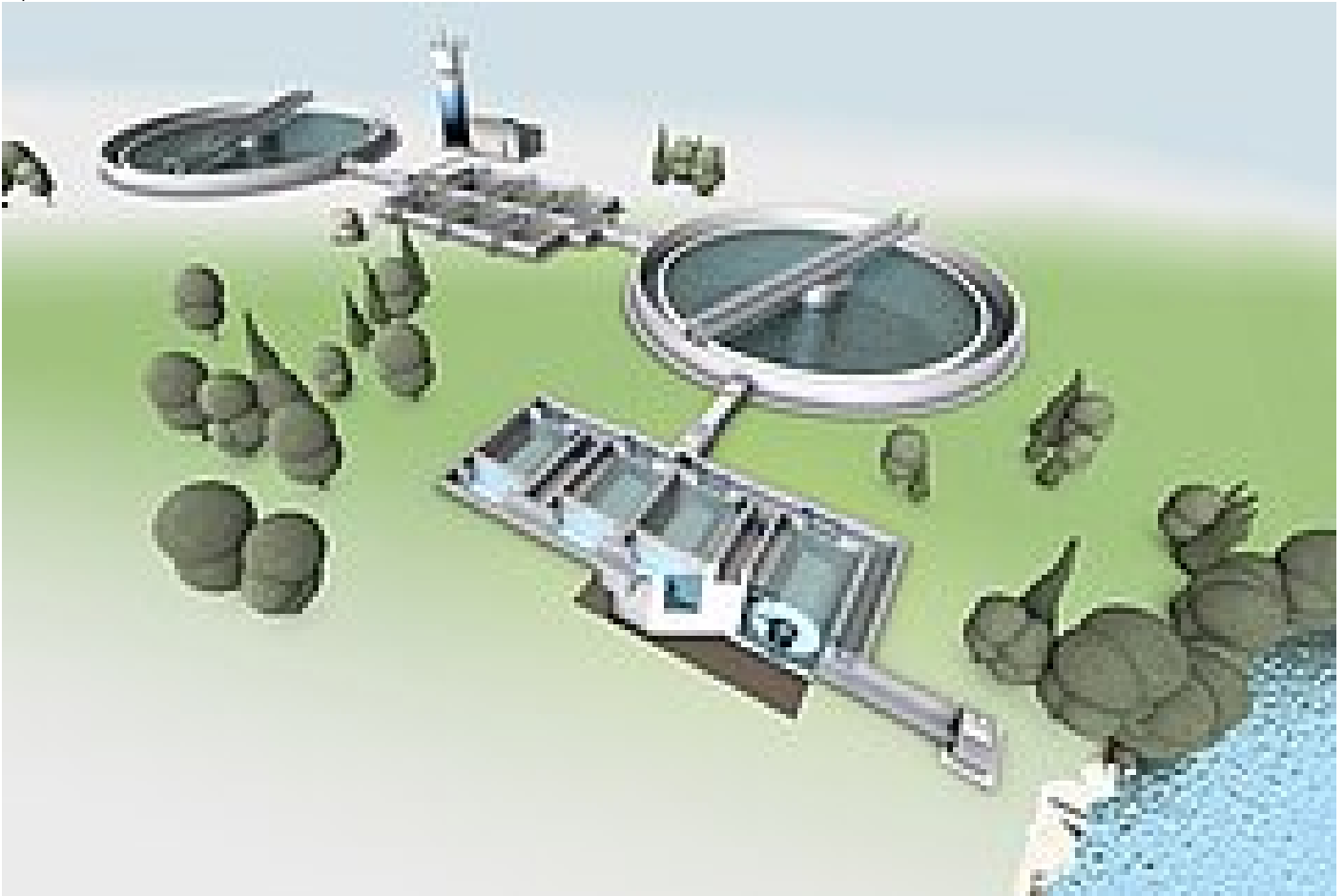
PAC process ("Ulm process") with downstream HUBER Disc Filter RotaFilt® as polishing filter

It has become apparent over the past few years that both adsorption and ozone treatment can be used for the 4th treatment stage. HUBER offers various high-performance key components for all these process solutions.