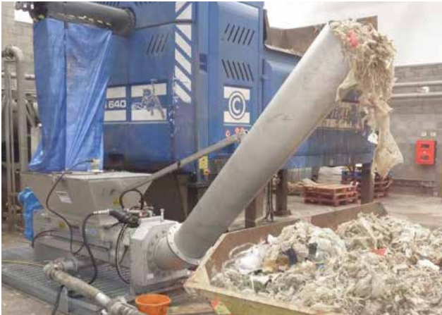
HUBER Wash Press WAP® at an English biowaste treatment plant.