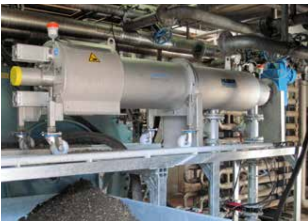
HUBER Sludge Cleaner STRAINPRESS® integrated into the pipeline (Great Britain).