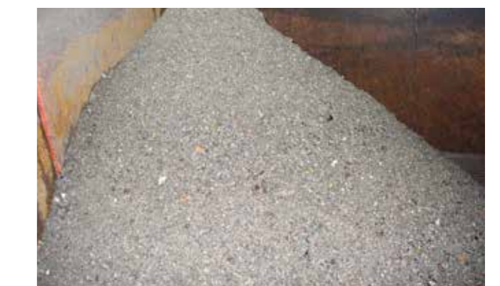
The product discharged from the HUBER Grit Washing Plant RoSF G4E Bio: washed mineral material.

The organic matter adhering to the contaminants is recovered by the HUBER Grit Washing Plant RoSF G4E Bio (No. 3) and is then returned to the biogas production process. The washed materials can be profitably sold for recultivation, for example. In addition, the integrated dewatering unit significantly reduces material transport costs.