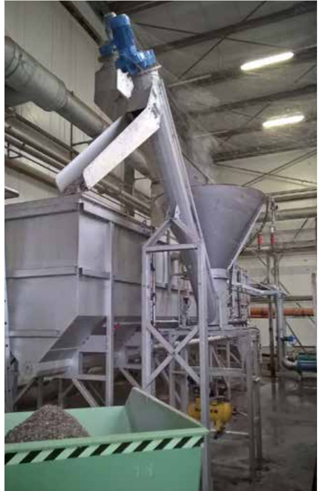
HUBER Grit Washing Plant RoSF G4E Bio at a German biowaste treatment plant.