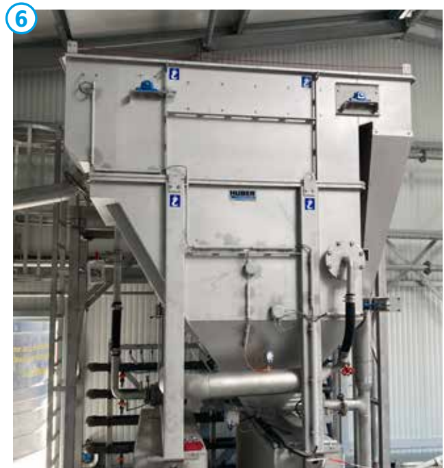
HUBER Dissolved Air Flotation Plant HDF.

The flotation sludge from the dissolved air flotation plant contains valuable organic substances that can be reused for biogas production.