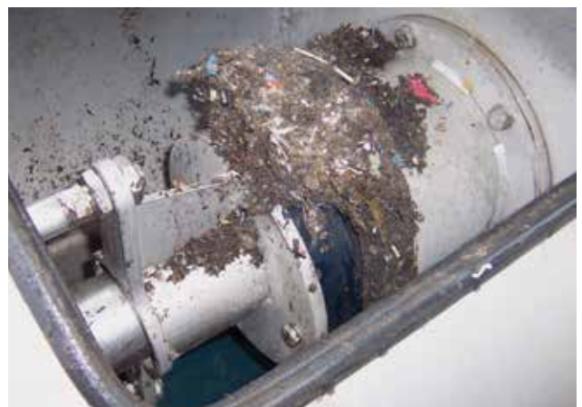
Separated and dewatered foreign matter from the HUBER STRAINPRESS® at a biological waste treatment plant in Germany.