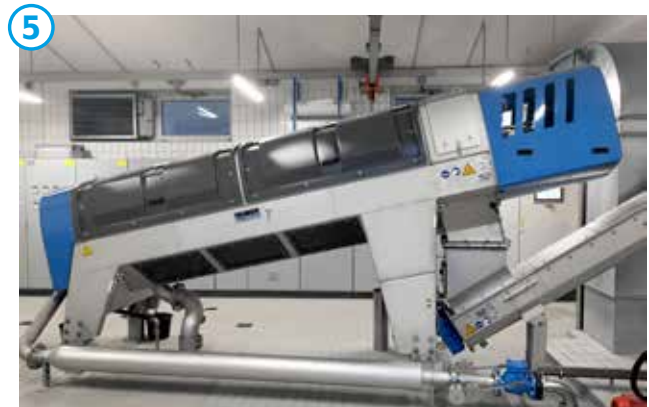
HUBER Screw Press Q-PRESS®.

The HUBER Screw Press Q-PRESS® (No. 5) dewateres the fermentation residue and reduces storage and transport costs to a minimum. The fully automatic screw drive is characterised by very low speed, highest energy efficiency and minimum maintenance.