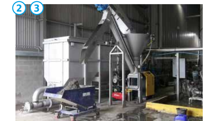
HUBER Longitudinal Grit Trap ROTAMAT® Ro6 Bio and HUBER Grit Washing Plant RoSF G4E Bio.

Furthermore, the compact HUBER Longitudinal Grit Trap is easy to integrate into the existing pipeline.