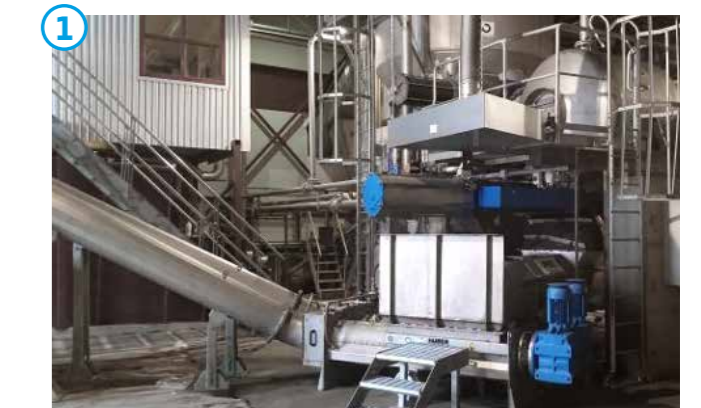
HUBER Wash Press WAP®.

The HUBER Wash Press WAP® (No. 1) recovers the organic matter adhering to the coarse material and returns it to the suspension. In addition, the HUBER Wash Press WAP® compacts the coarse materials, which can thus be disposed of at lower cost.