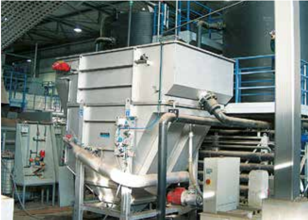
HUBER Dissolved Air Flotation HDF at a food waste treatment plant in Spain.

More than 60 reference installations in (bio-)waste treatment worldwide: