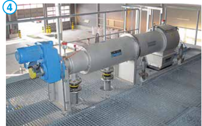
HUBER Sludge Cleaner STRAINPRESS®.

However, legal requirements have to be met so that the fermentation product can be spread on agricultural land, for example. The solution to this is the HUBER Sludge Cleaner STRAINPRESS® (No. 4), which specifically separates foreign materials such as plastic particles and at the same time dewateres them, thus reducing costs.