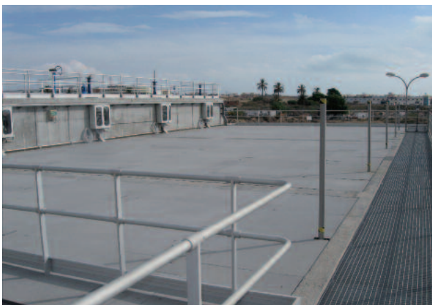
HUBER Sandfilter CONTIFLOW® C, Rincon de Leon, Spain