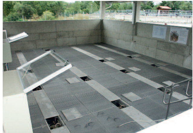
HUBER Sandfilter CONTIFLOW® C , Wolfratshausen, Germany