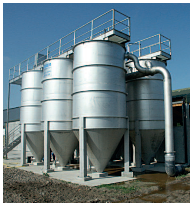
HUBER Sandfilter CONTIFLOW® 51, Montmartin, France

In case of increased disinfection requirements, installation of a subsequent disinfection system is possible due to the low concentration of solids in the filtrate.