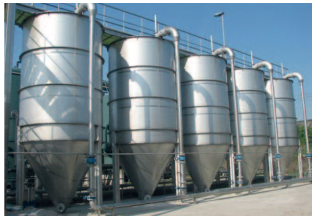
HUBER Sandfilter CONTIFLOW® 72, Montebello, Italy