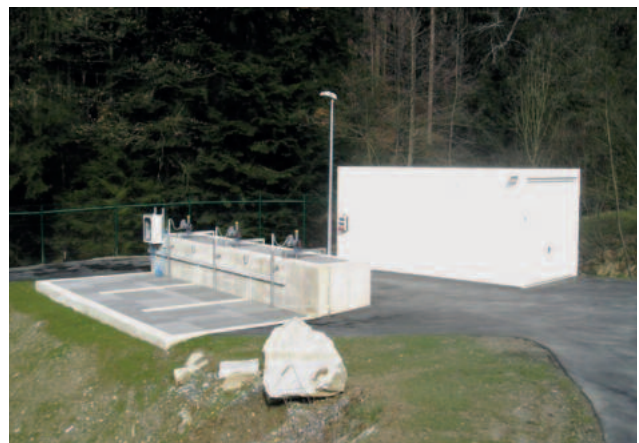
HUBER Sandfilter CONTIFLOW® C, Salzweg, Germany