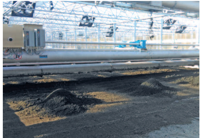
Automated sludge feeding with screw conveyors