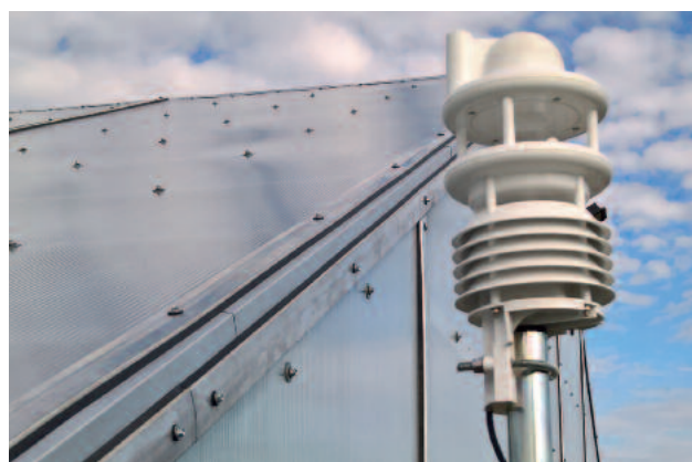
The weather station delivers measurements for an automatically regulated climate control system.