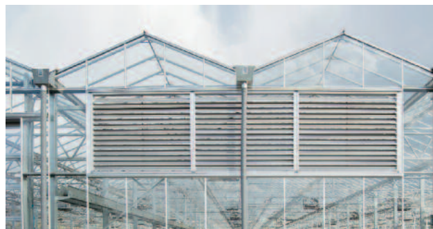
Fresh air enters the drying hall via weather louvres.

Our almost 20 years of experience and more than 250 dryer lines sold on all continents are proof of the high quality of the HUBER system and its suitability for application worldwide.