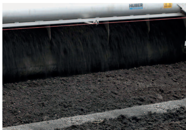
The HUBER Sludge Turner SOLSTICE® ensures an optimal drying bed - the sludge is spread, granulated, aerated, turned and backmixed.

The HUBER Sludge Turner SOLSTICE® travels on floor-protecting rollers on the driveway walls, the constructional requirements are therefore low. Synchronous travel along the sludge bed is ensured by the omega-type chain guiding system.