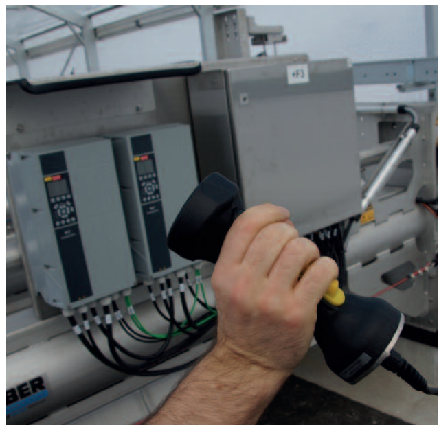
Enabling button for safe maintenance