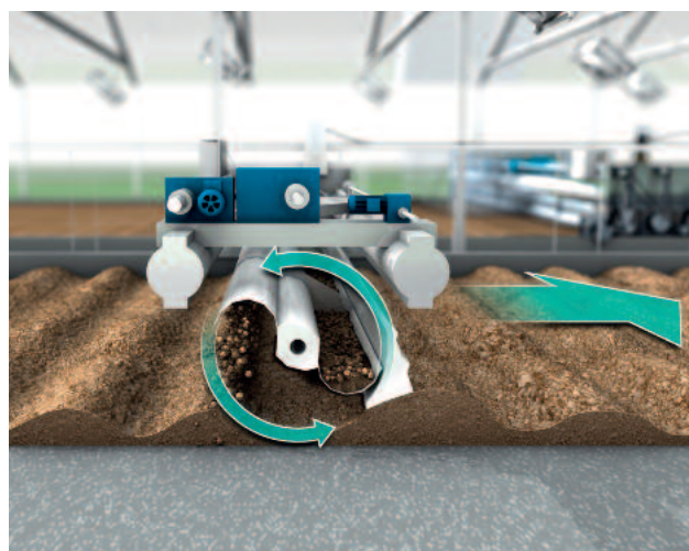
A double shovel is ploughing through the sludge bed and turning the sludge as the machine is moving through the greenhouse

Operating costs are low and plant operators profit from a sustained reduction of disposal costs.