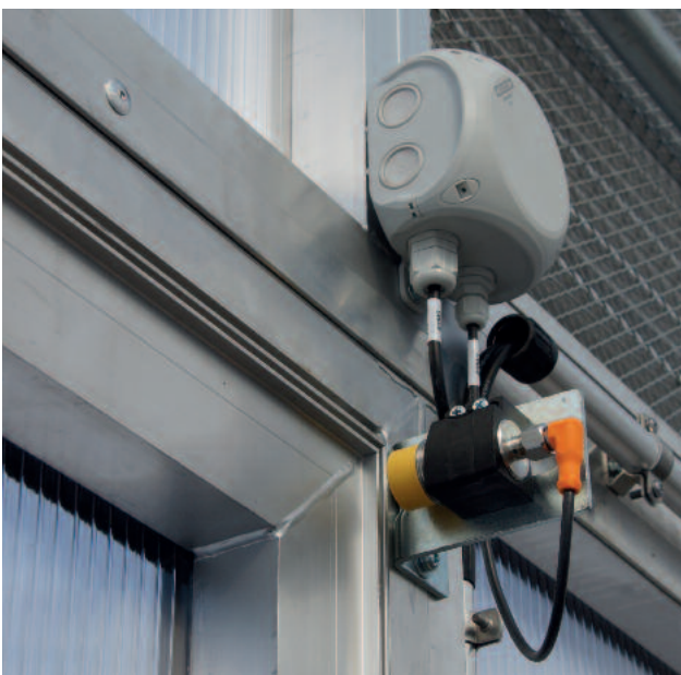
Safety sensors monitor access