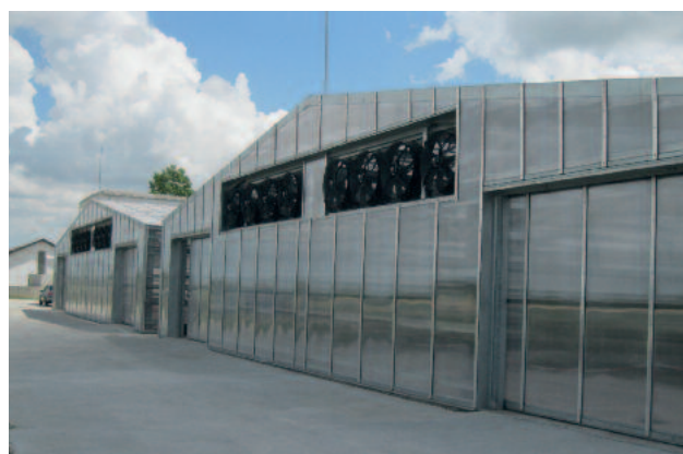
Exhaust fans remove saturated air from the drying halls.