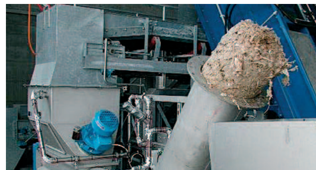
Well washed and virtually odorless screenings from a HUBER Screenings Wash Press WAP® SL, compacted to 50 % DS