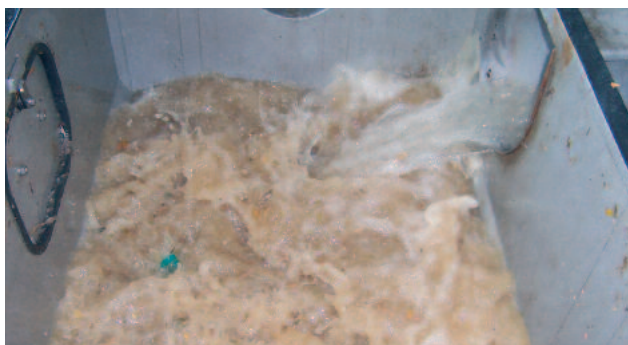
High turbulence in the launder tank during impeller operation

The screenings drop from the screen or conveyor into the launder tank. Screened wastewater or process water is directly introduced into the tank as wash water.