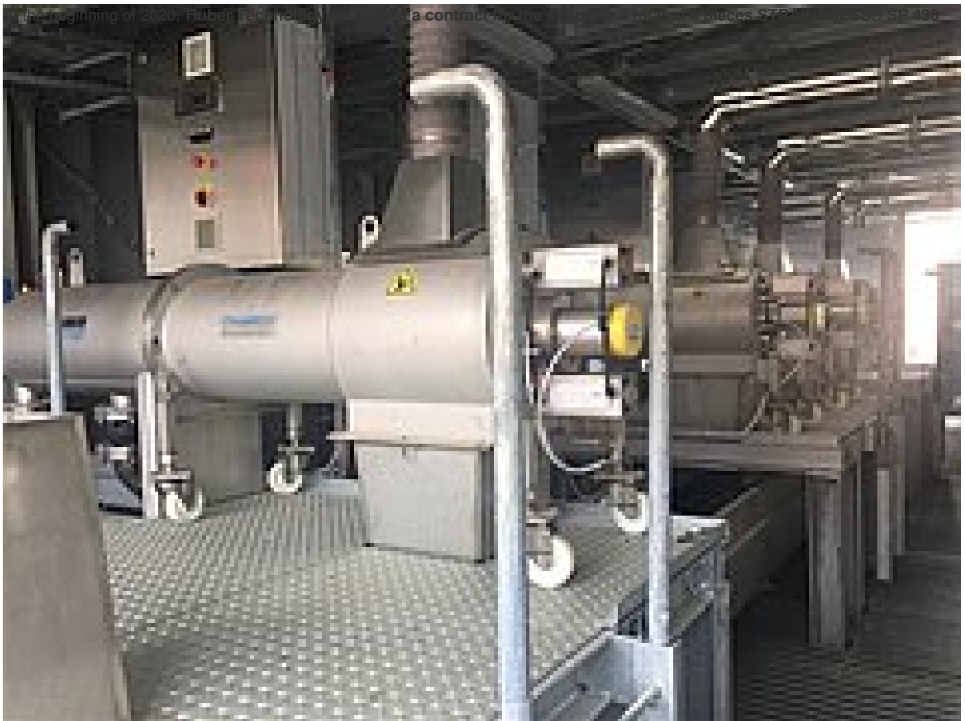
Series of STRAINPRESS® Sludge Screens installed at the East Rome WWTP.

The City of Rome has in total three major WWTPs which are all being operated by ACEA SPA. Due to major operating issues and maintenance cost caused by settlement and accumulation of high amounts screenings/solids inside the digestors, ACEA has approached HUBER to discuss the possibility to install a sludge screening system at the South and North WWTPs and to increase the existing capacities of Strainpress SP290 units at the East WWTP. The sludge line at these plants consists of pre-thickening followed by anaerobic digestion, post-thickening before the sludge is being dewatered via decanter centrifuges.