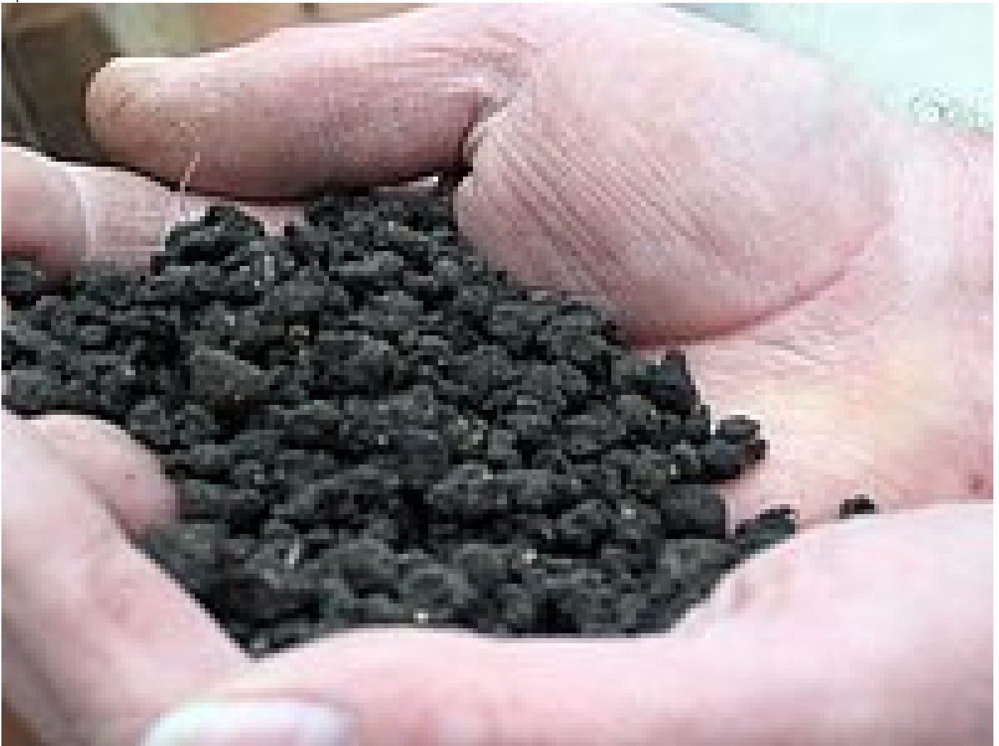
Free-flowing dried granulate with low dust content

The HUBER Solution for sewage sludge drying with solar energy is working with a continuous drying process, that is odourless due to complete restacking of the sludge. Its unique combination of sludge turning and transport performs both spreading and turning of the sludge as well as baxmixing and its transport from one side to the other. Due to their high efficiency our solar dryers can be operated the whole year round even in temperate climate zones with solar power alone. This gives of course an outstanding eco-balance and cost-efficiency.