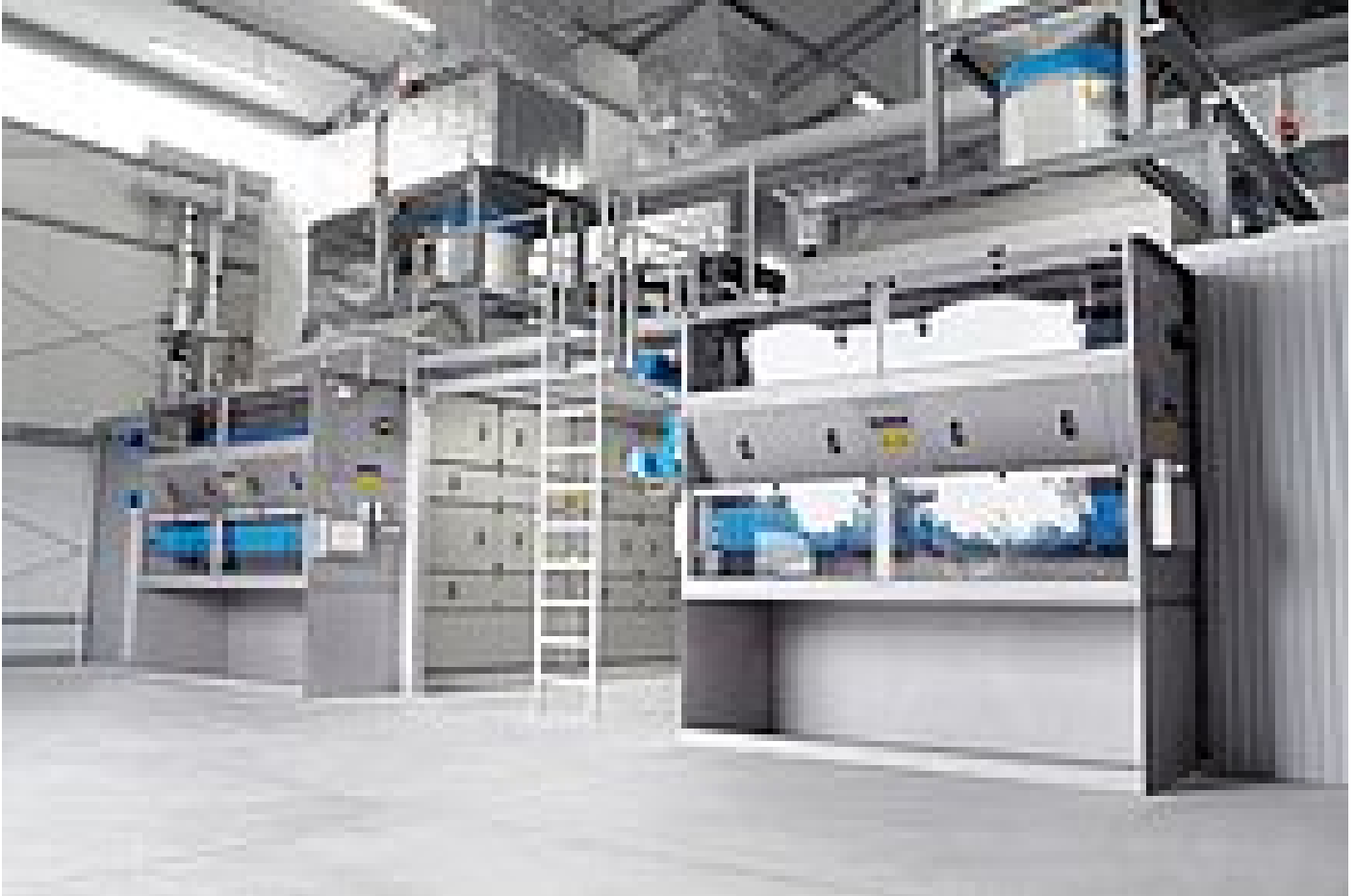
HUBER Sewage sludge drying plant on STP Ingolstadt

Two HUBER belt dryers type KULT BT 80 were put into operation on STP Ingolstadt in August 2005. The installed total dryer surface is 160 m 2 which is the same as that of our new dryer type BT 16.