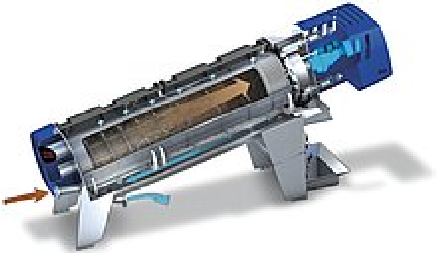
Partial section of a HUBER Screw Press Q-PRESS®

The further developed HUBER Q-PRESS® was presented for the first time at IFAT 2016. The first units were installed soon and have meanwhile been in operation for more than a year. Now, it is time to review the operational experience gained on site against development targets.