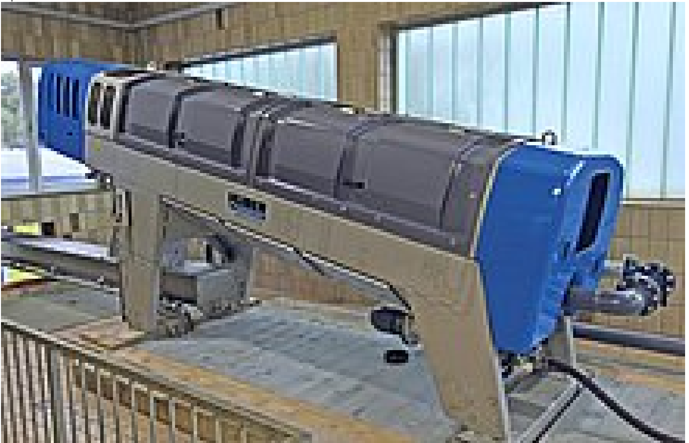
Stationary unit of a HUBER Screw Press Q-PRESS® 620.2