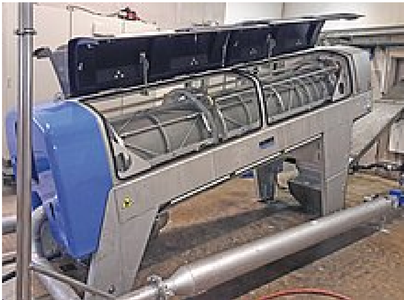
HUBER Screw Press Q-PRESS® 620.2 with open cover

New HUBER Screw Press Q-PRESS® 620.2 for sludge dewatering: operational experience on STP Bad Orb